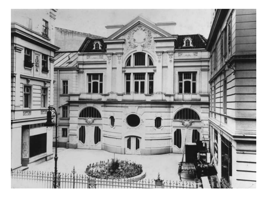
Fig. 4. Kulturbund Theater on the Kommandantenstrasse.