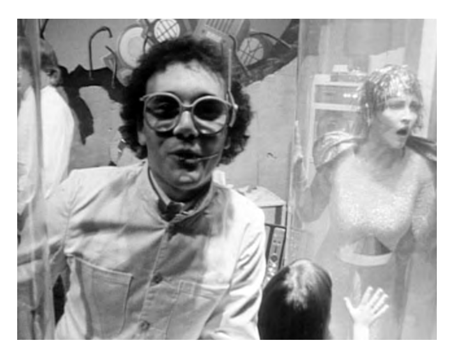
Figure 1. Trevor Horn sings, with the space age heroine in the backdrop, in a shot from the Buggles' "Video Killed the Radio Star" (1979).

"mod" style of the British Invasion. Likewise, the background singers' costumes—an assemblage of sharp angles, tight belts, restrictive turtlenecks, and blonde wigs—are a decade past their prime. They could be Star Trek uniforms, or direct descendants of the futuristic "space age" fashion styles popularized by 1960s designers like André Courrèges. Many of the song's vocal hooks look back toward an earlier rock and pop era as well. The female singers' staccato "oh-a-oh" refrain recalls the quirky glottal stops and hiccups of Buddy Holly's late 1950s rockabilly style, while the octave leap and descent of the ending legato "operatic" vocal melody—"you are the radio star"—nostalgically hints at the descant of an older novelty hit, the Tokens' 1961 chart topper, "The Lion Sleeps Tonight." Even the Buggles' name itself comes across as a willful misreading of the Beatles. For a band and song supposedly gazing toward the future technologies of the 1980s, surprisingly much of "Video Killed the Radio Star" is pasted together from var-