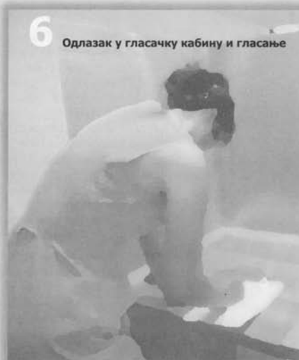
Fig. 2. "The Voting Process in the Polling Station," 2000. This informational sheet was to be handed to voters while they waited in line to vote so that they were prepared for what was to come.