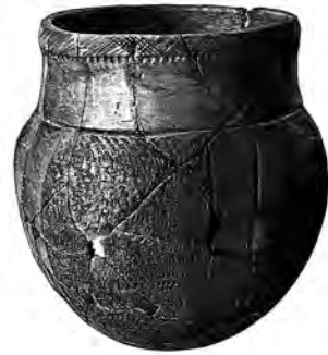
Artifacts found in burial mounds provided important information on the culture of the Hopewell Indians.

steps of grinding, cutting, embossing, perforating and polishing were employed.” Native Americans craftsmen created “tens of thousands of useful and artistic items, ranging from dozens of varieties of projectile points, knives, harpoons and awls to decorative gorgets, bracelets and beads.” These items then were “widely traded” and have been found as far away as Florida and the Canadian prairies. The location of prehistoric Indian mining pits also aided miners in locating copper deposits during the Copper Boom of the 1840s. 2