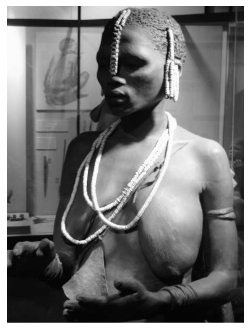
Khoisan woman.