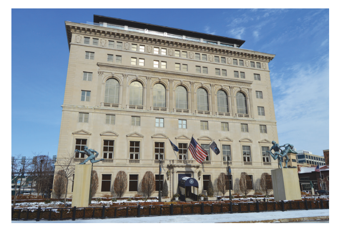
The historic Detroit Athletic Club.