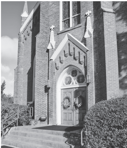
Saint Patrick's Church on Whitmore Lake Road, the oldest English-speaking parish in the state