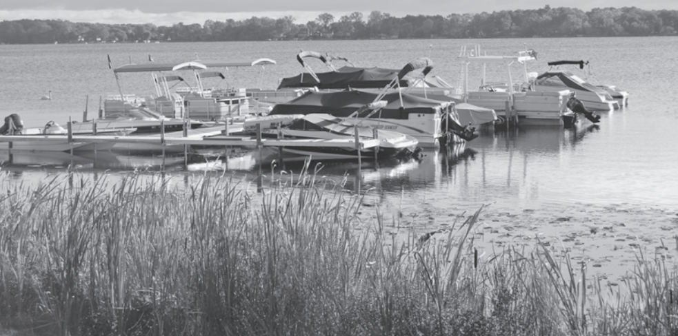
Boats await a pleasant day on Whitmore Lake

County at mile 6.1. The environment comes to include more houses and fewer farms. At the first stop sign since you turned onto Strawberry Lake Road, turn right on Hamburg Road at mile 9.9; there will be a cemetery ahead and on the left as you make the turn. For the next few miles follow the main paved road as it turns left and then right. As you head in a southeasterly direction, the name of the road changes (although it is not always well marked). From Hamburg Road bear left onto Sheldon Road, then Hall Road, and finally 8 Mile Road.