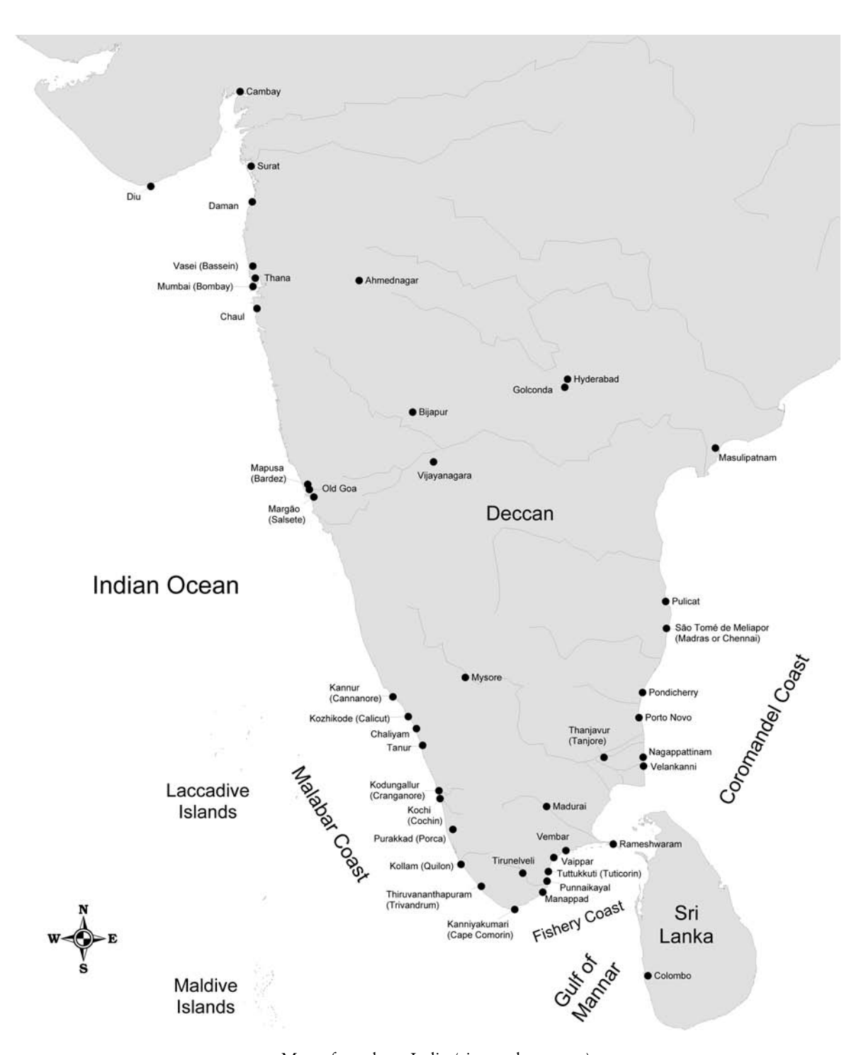
Map of southern India (sixteenth century)